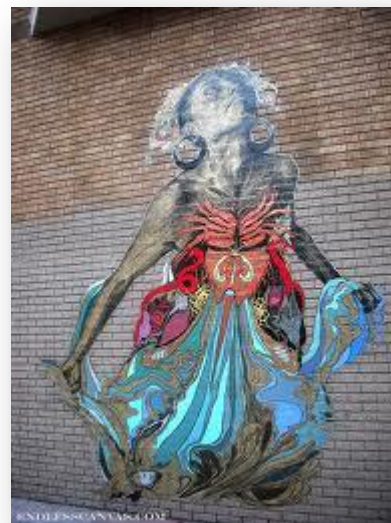
Large Scale Block Print with wheat paste paper...by swoon