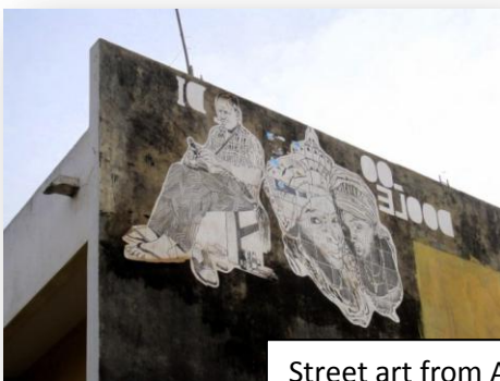
Street art from Africa Color

End Product: Through printmaking's large scale prints the end goal result will be large scale pieces that would be utilized within the Hip-Hop-Opera and showcased at the Sunu Thioossane's end of the summer parent night.